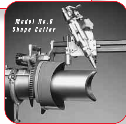
Model No. 0 Shape Cutter