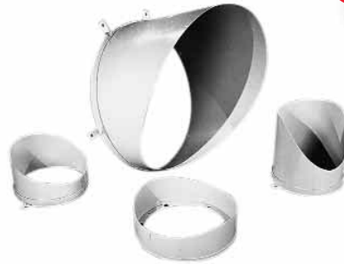
Examples of Custom-Made Templates from H&M